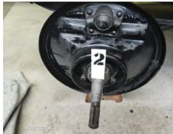
One of the front spindles and backing plates ready for new brake shoes.