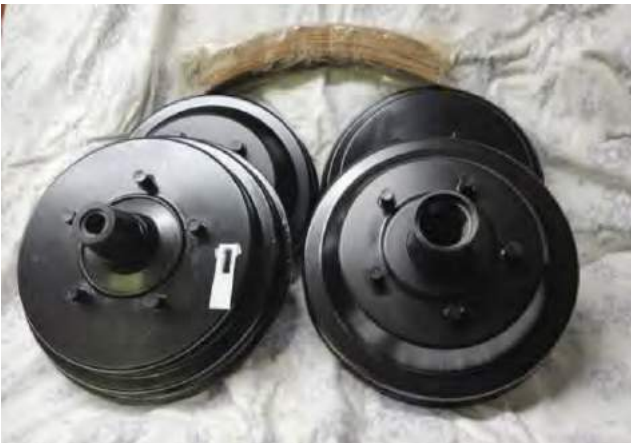
This is the set of brand new front and rear cast iron brake shoes and brake shoe linings as received. They are well-made and look good, too.

Overall, it's not a really hard job; it just takes time. If, at 88, I can do it, so can you youngsters.