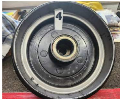
New brake drum with new grease seal and snap ring installed, ready to be put on the spindle.