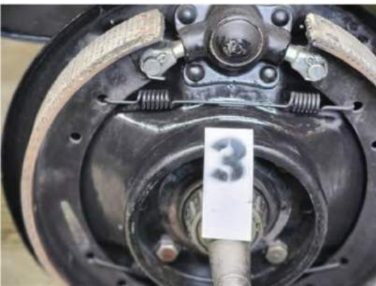
Brake shoes with new linings installed on backing plate. Notice how nice and thick the new linings are. They should last thousands of miles of use